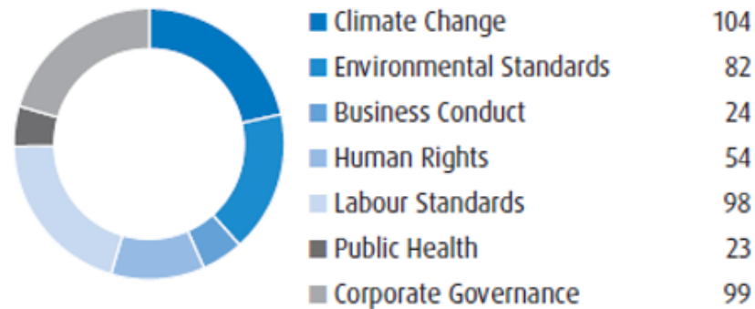
Engagements by theme **